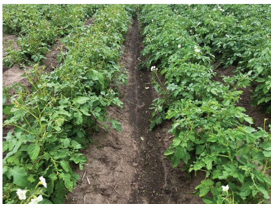
TOMBSTONE HELIOS 3.2 oz./A VS. TOMBSTONE HELIOS 3.2 oz./A + REFORM 7 oz./A