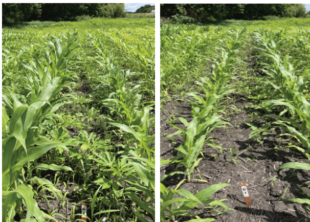
Acetochlor 2.25 pts